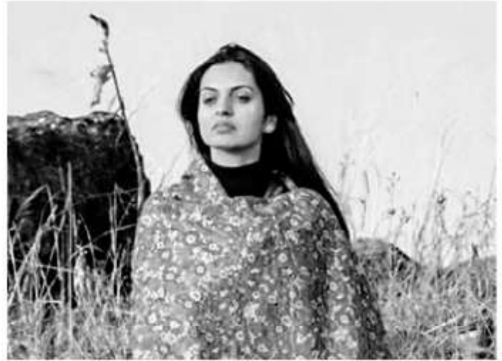
Sohra Bridge/Bengali/Dir: Bappaditya Bandopadhyay